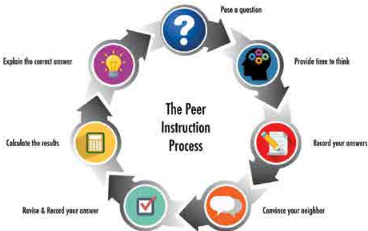
Fig. 2. A diagram of the seven steps in the peer-instruction process.

Regarding the central nature of argumentation in science, Peer Instruction strengthens the conceptual fluency of students with correct answers. Such students may or may not fully understand all of the concepts behind the correct answer. Peer Instruction provides these students with a chance to talk through their thinking, particularly when a peer asks questions. As a result, it helps them think through their response and articulate it so that another student can understand it.