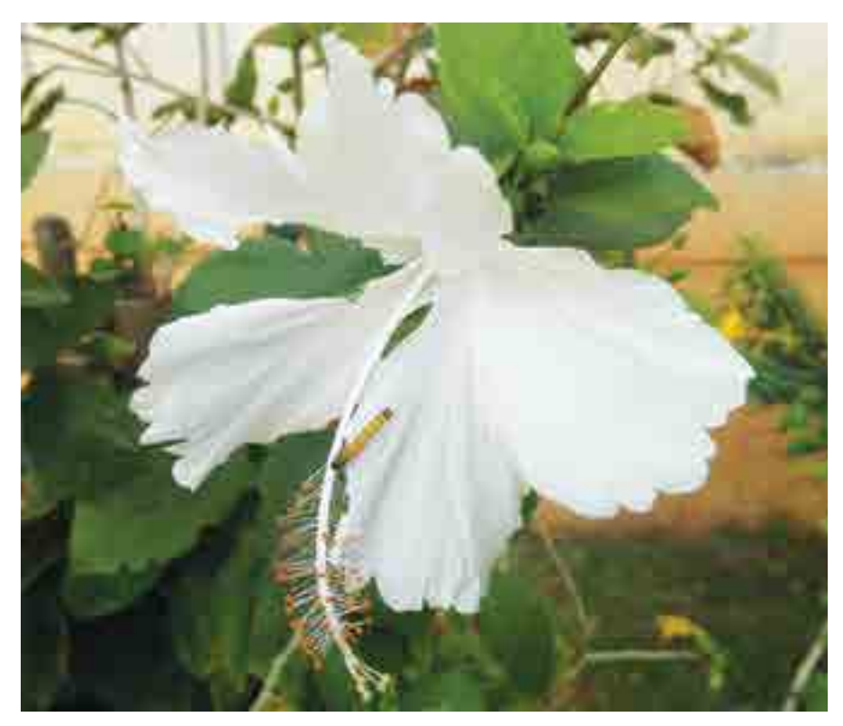
Fig. 4. A florivore feeding on a Hibiscus flower. Credits: V. S. Pragadheesh. License: CC-BY-NC.