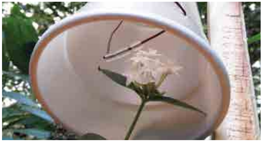
(a) Solid-phase extraction of volatiles using Polydimethylsiloxane (PDMS) tubes from an inflorescence of Pentas lanceolata .

Fig. 6. Examples of solid-phase extraction of plant volatiles.