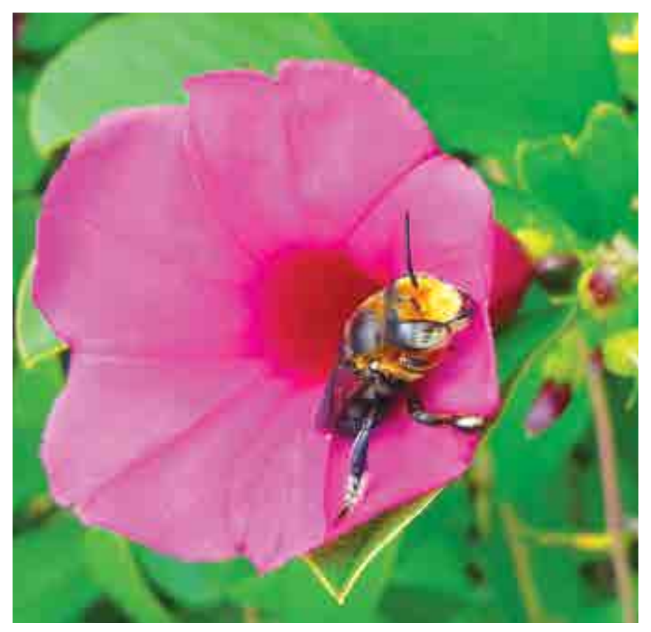
Fig. 3. An insect pollinating a flower. Credits: V. S. Pragadheesh. License: CC-BY-NC.

Alternatively, some pollinators only visit a single species of flowering plant throughout their lifetime. Such pollinators are termed as specialists. In