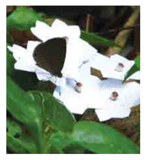
Fig. 7. An insect visiting an artificial flower made of paper and artificial odour. Credits: Shravathi Krishna. License: CC-BY-NC.

can then use these lures to test how different colours, shapes, and scents change the preference of pollinators in different ecologies<sup>8, 9</sup>.