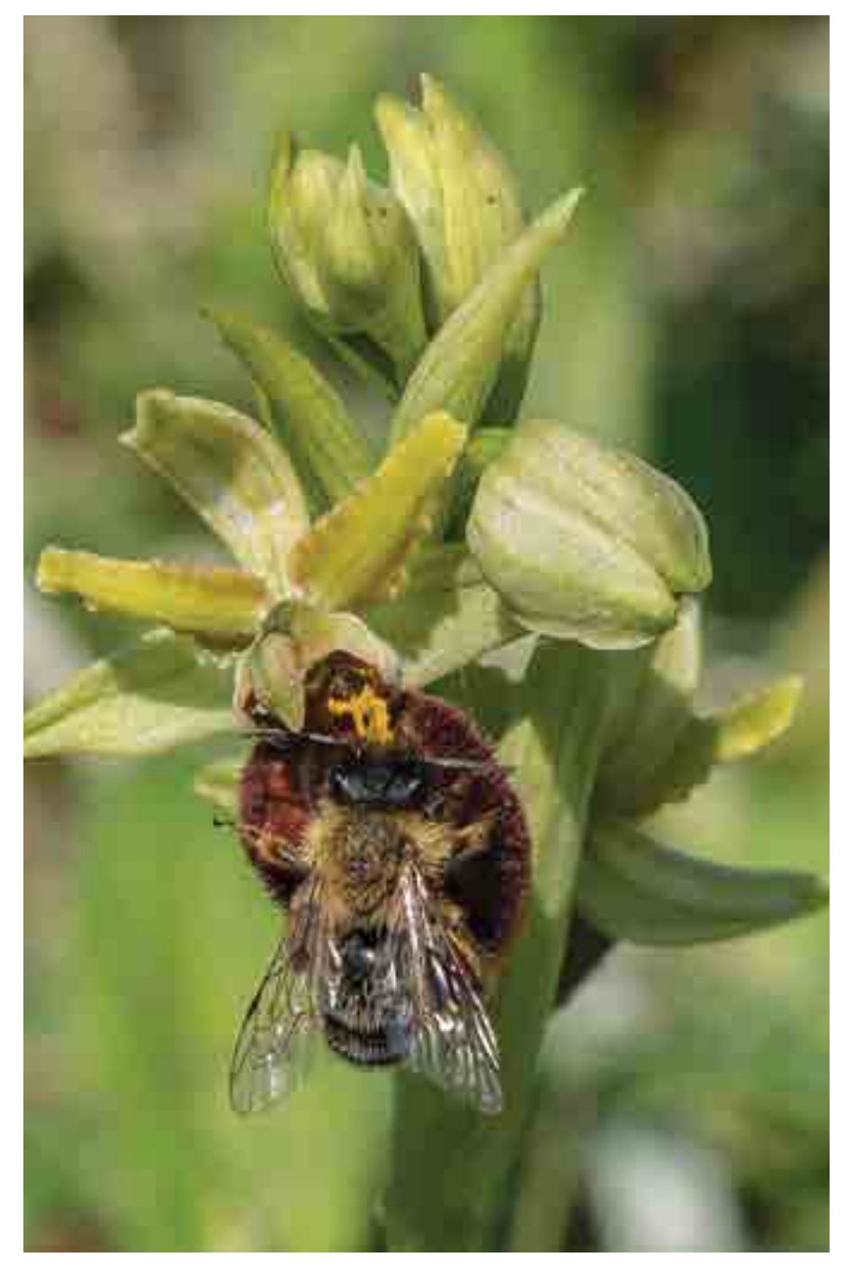
Fig. 5. A mining bee (Andrena nigroaenea) pollinating an early spider orchid (Ophrys sphegodes).

increases in concentration and inhibits further visitations by male bees<sup>7</sup>. Since the biosynthesis of flower scent is a costly effort, plants like the Orphys orchid use these chemical odours judiciously to maximize pollination by reducing the attraction of insects to already pollinated flowers.