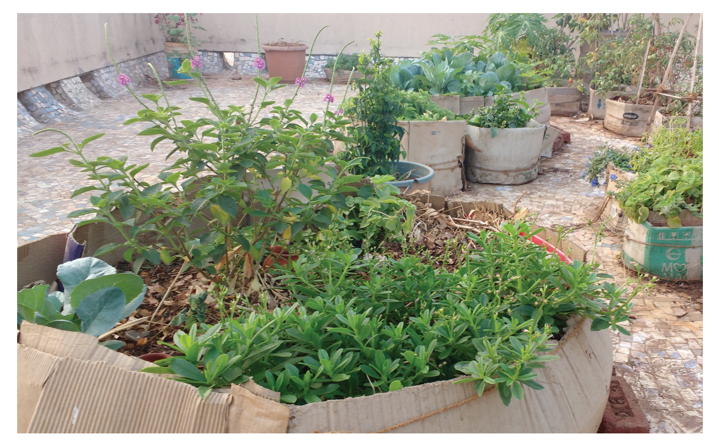
Fig. 4. Carboard planters are used to grow a variety of plants.

to involve 20 students working for two hours every week. However, it was only possible to carve out an hour of student time every Saturday. Similarly, given the packed academic schedules of grade IX and X students, the first batch of students involved in the project were from grade VIII. This trend has continued, and students who graduate each year are invited to mentor students from the successive batch for a month. This has helped create a student 'teacher-learner' community across different grades. In the coming year, based on student interest (and that of their parents), the terrace farm may be opened once every fortnight for volunteer work. In this way, older students will have the opportunity to continue participating in the project outside school hours.