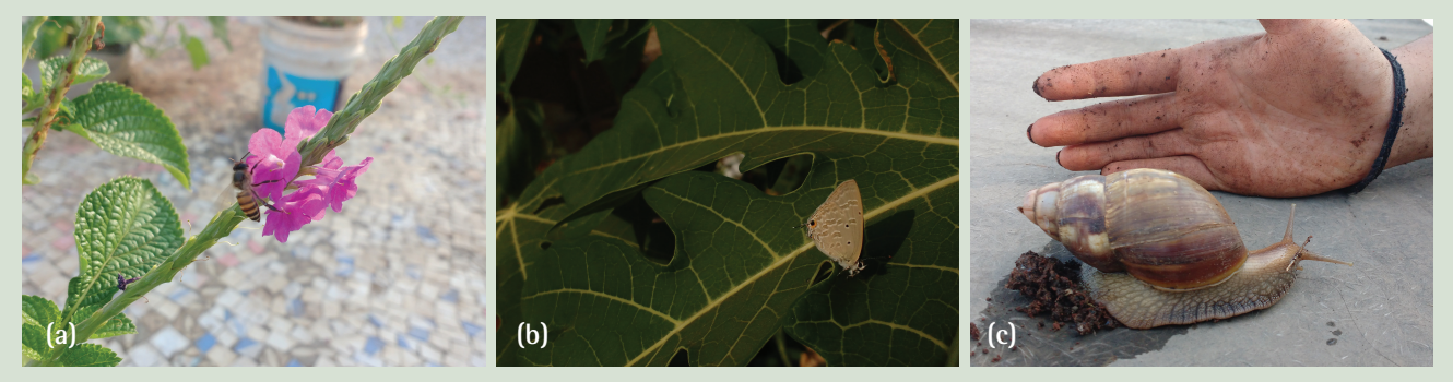
Fig. 2. Some frequent visitors to the terrace farm. (a) A bee on the Blue Spike plant. (b) A butterfly on the terrace. (c) Students discovering snails on their farm. Credits: Deborah Dutta. License: CC-BY-NC.

As the farm has flourished, students have started appreciating the role of different organisms in the process of growing food. For e.g., sightings of lady birds and ants near an aphid infestation on some plants provided tangible examples of food webs that might exist on the farm. In another instance, some students expressed their willingness to 'share' the farm harvest with giant snails (usually considered a pest) because " the snails also needed some food ".