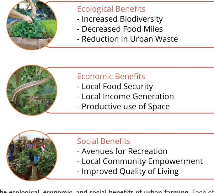
Fig. 1. The ecological, economic, and social benefits of urban farming. Each of these can be a theme for discussion and research with students. Credits: Deborah Dutta. License: CC-BY.

The scarcity of land in 'megacities', like Mumbai, has led to the emergence of an interesting alternative — using rooftops to grow food. Many individuals and volunteer groups are now growing a