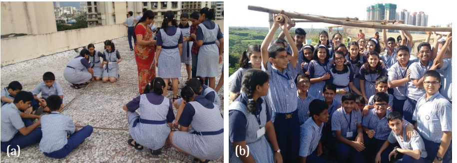
Fig. 8. Students work on building support structures for the farm. Credits: Deborah Dutta. License: CC-BY-NC.