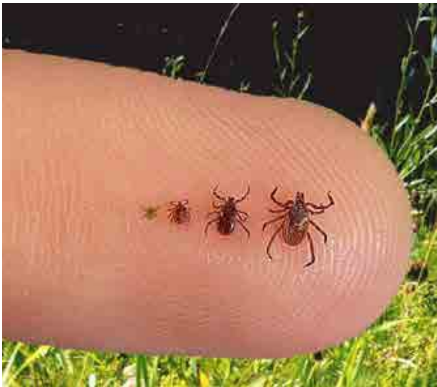
Fig. 2. Like mosquitoes, ticks of domestic and wild animals can act as vectors or transmission agents of human pathogens.