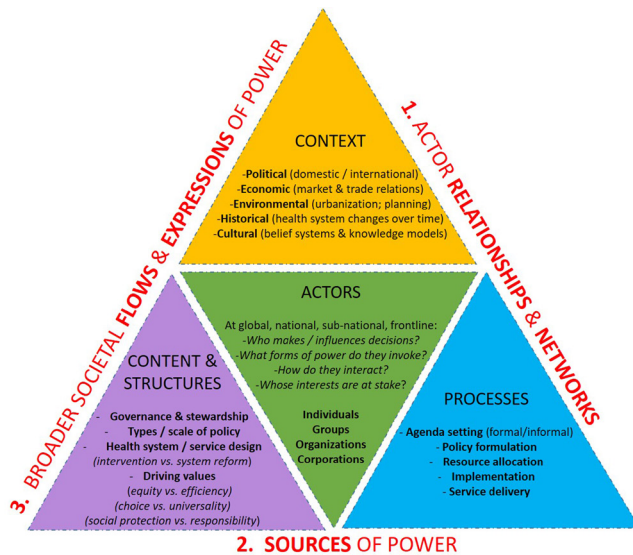
Figure 1 Three empirical sites of power research in health policy and systems.

document review) associated with a given methodology, as other resources address these topics in detail. 19 21 23 24