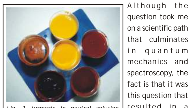
Fig. 1 Turmeric in neutral solution at center surrounded by its colors in various chemicals: clockwise starting from yellow(vinegar), quick lime or choona (Ca(OH)<sub>2</sub>), Ammonia, hair & grease remover, and oven cleaner.

another day, when I was about 14, I saw my mother mixing turmeric water with white choona, (also known as sunnambu in Tamil; quick lime/white wash, etc. in English), and the immediate result was that the yellowcolored solution turned blood red. In many of the Hindu ceremonies, one of the traditional practices is to perform aarathi and the ladies prepare the aarathi by mixing yellow turmeric solution with the white alkaline choona-like substance that is predominantly composed of calcium hydroxide. Why does this yellow color of turmeric change to red? This question sparked my early interest in science, and my quest to understand this took me along a path of understanding the beauty of nature. Recently, we have tried to use a variety of household chemicals to create a kaleidoscope of colors from turmeric that are shown in Fig. 1.